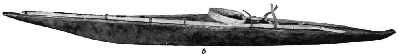
Wood and skin kayak model from Ungava Bay showing the form of the Labrador kayak (From Hawkes, 1916, Plate XIV A.b.)