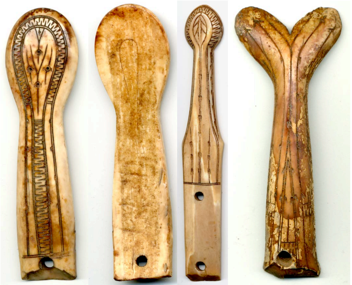
Punuk chisel handles, 15.5, 20.8 and 11.2 cm

Decorated chisel handles of the type shown above appear to be largely if not entirely a Punuk invention. The two holes were used for lashing a bone or antler jacket clip with an inserted stone blade (Sergey Arutiunov, personal communication), and the handles frequently have the portion containing the distal hole missing due to breakage with use. Because their function has generally not been recognized, they are described only as “handles” (e.g., Wardwell, 1986, Nos. 126 and 128), or as Punuk “ornaments” (often in the form of a whale tail; Fitzhugh et al., 2009, Figs. 4 and 5, p. 210).