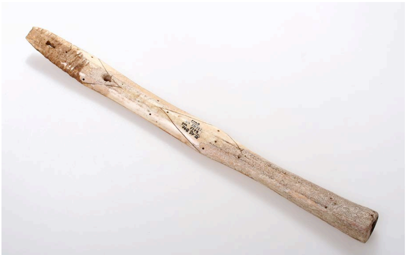
Early Punuk socket piece from the harpoon set found in Ekven burial 319, 32 cm