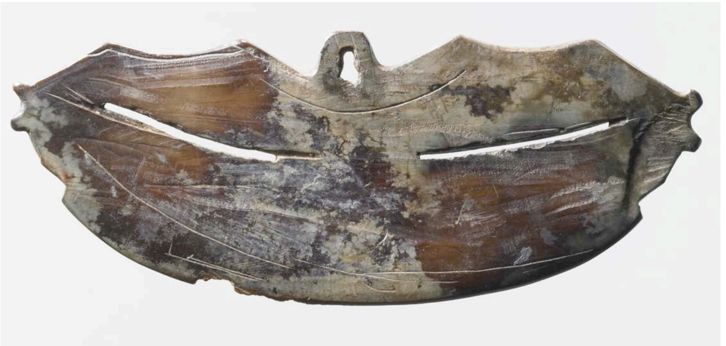
Okvik pendant, 9.8 cm