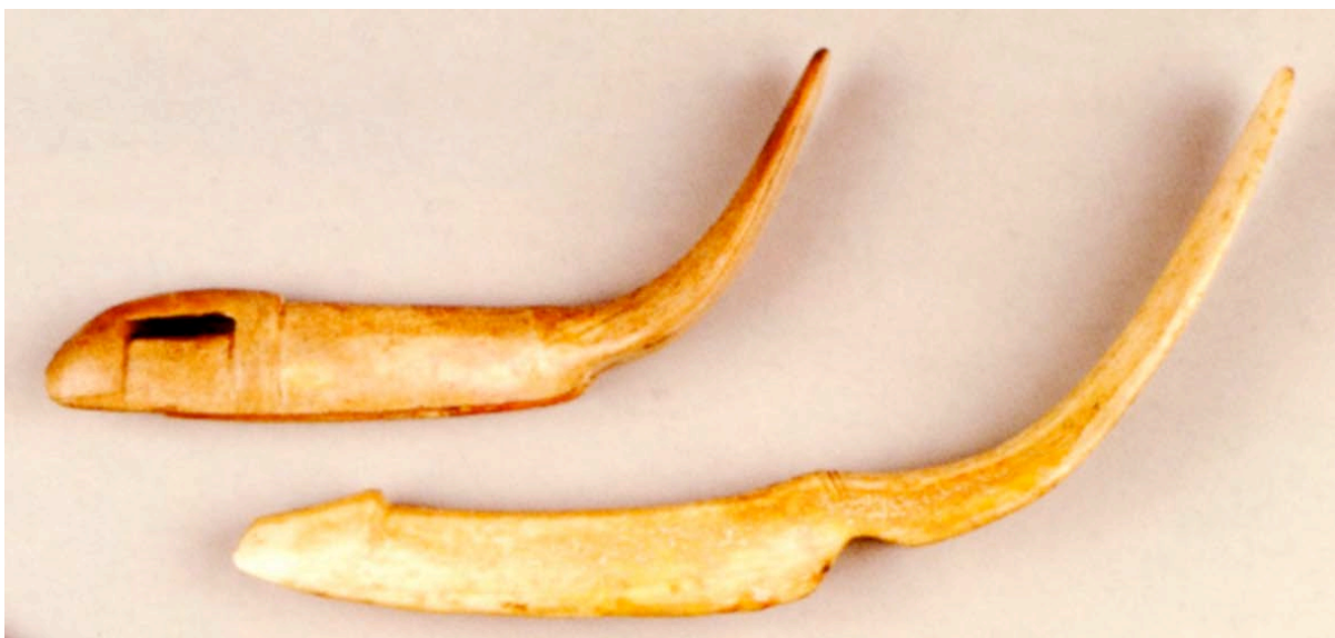
Undecorated Okvik or OBS II flaker handles from the Ekven site, Chukotka (Bronshstein et al., 2007, #303 and 304, 12.7 and 14.7 cm).

Right: 19 th century flint flakers from the Point Barrow area, showing the manner of attaching the blade with seal thong (a) and then tightened by inserting a wood splinter in the back of the groove (Murdock, 1892, p. 288).